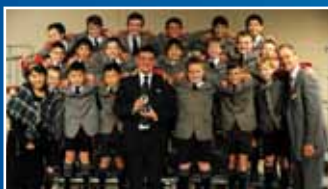
The King's Prep School Choir