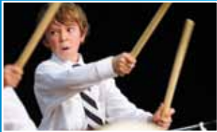
Hardworking percussionist from Newington College