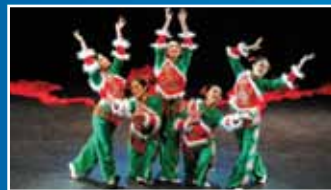
Chinese Youth League of Australia