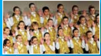
Cherrybrook Public School Choir