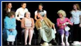
Hunter Region Drama School