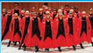
Australian Dance PerformanceInstitute