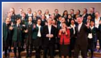
PLC Sydney Chamber Choir