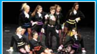
Brent Street Studios