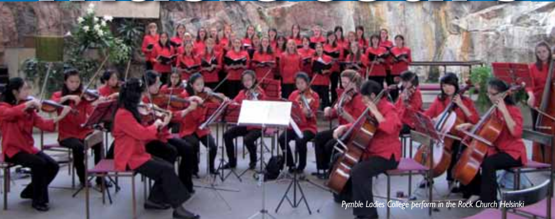
Pymble Ladies College perform in the Rock Church Helsinki