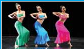
Mian Yang Bo Yuan Vocational School