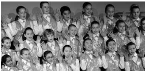
Cherrybrook Public School Choir: Winner: Primary School Show Choir.