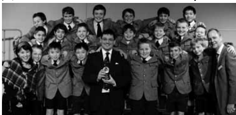
The King's Preparatory School Chamber Choir: Winner: Sydney Eisteddfod The John Lamble Australasian Championship for Primary School Choirs.

Minimum 16 Voices. 4 microphones & facilities for backing CD will be supplied (see also events 51 & 52). Presentation may include costumes, movement and props. Any combination of voices. Accompanied or unaccompanied. No restriction has been placed on the number or type of instruments used. Choir material may be folk, contemporary, music theatre, gospel, barbershop or light classical. Test: A selection of at least two contrasting items. Total Performance Time of up to 10 minutes. 1st: $300. 2nd & 3rd: Shields. Sponsored by The John Lamble Foundation. Note: See requirement for an item from an Australian composer or arranger in the Championship Finals. Final: 1st, 2nd & 3rd placegetters automatically qualify to compete in Event I13S - see event conditions. NOTE: Groups will be presented with an audio recording of their items at the end of each performance. Entry Fee: $79