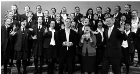
PLC Sydney Chamber Choir: Winner: Sydney Eisteddfod The John Lamble Australasian Championship for Youth Choirs (19/14).

2nd: $150. 3rd: Shield. Sponsored by the Royal School of Church Music Australia (NSW Branch). Note: See requirement for an item from an Australian composer or arranger in the Championship Finals. Final: 1st, 2nd & 3rd placegetters automatically qualify to compete in Event I13S - see event conditions. NOTE: Groups will be presented with an audio recording of their items at the end of each performance. Entry Fee: $79