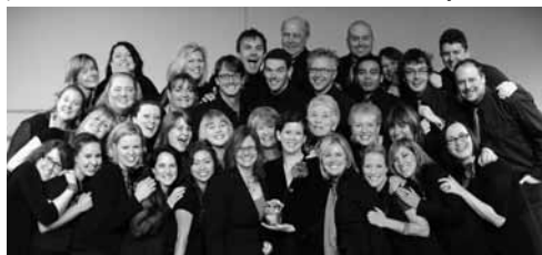
Soulfood: Winner: Sydney Eisteddfod The John Lamble Australasian Open Choral Championship.